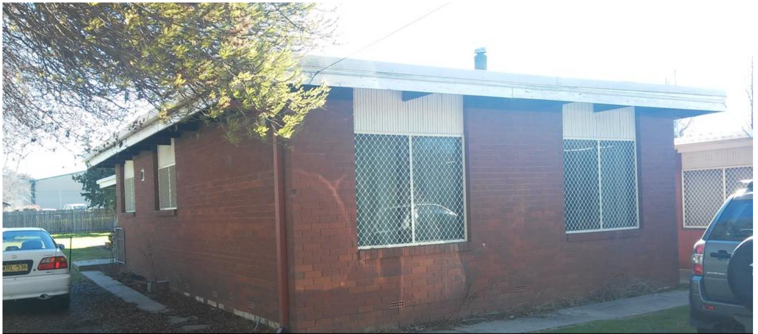
ROOM 7, 68 Niagara Street, Armidale