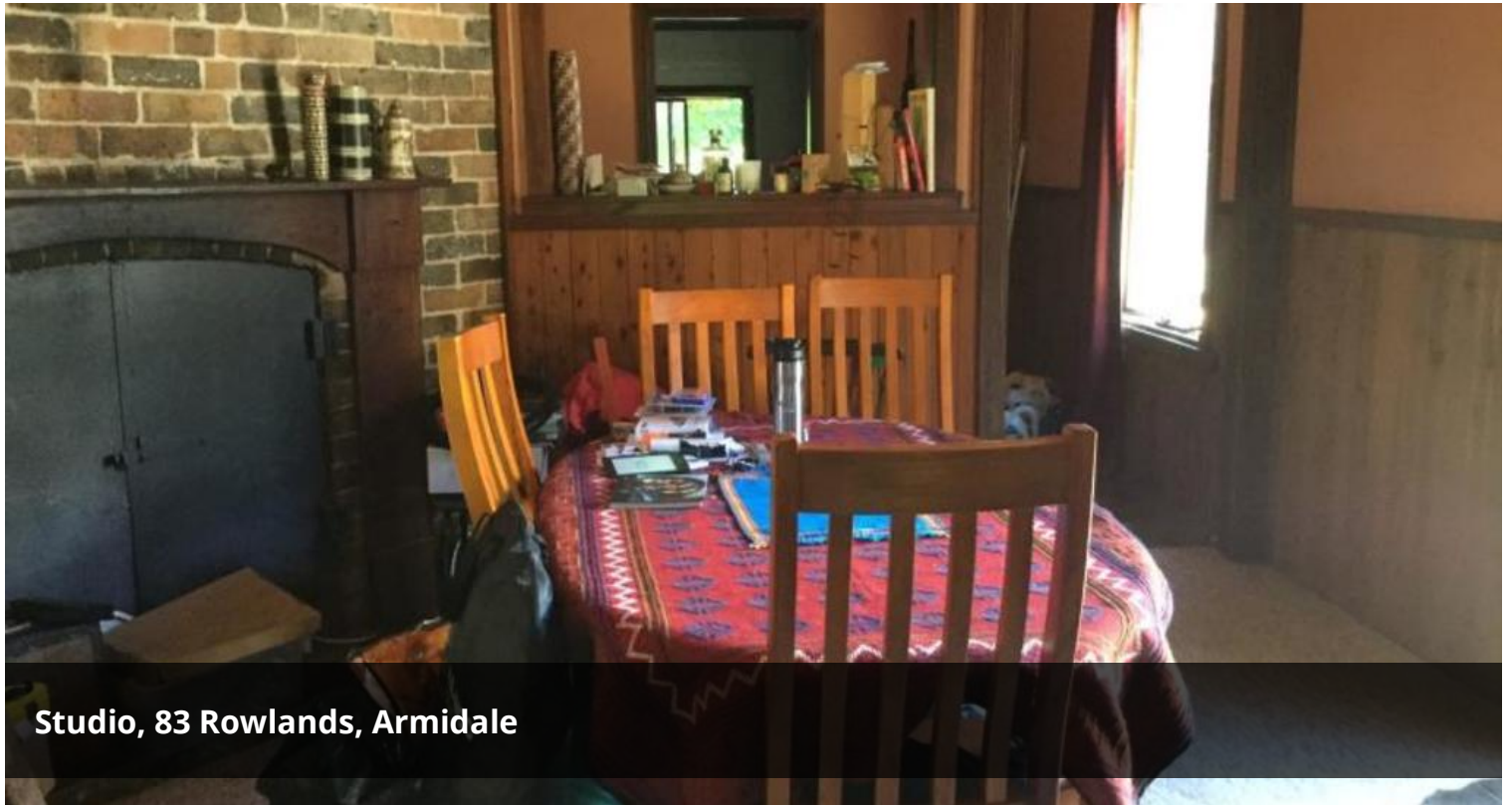
Studio, 83 Rowlands, Armidale